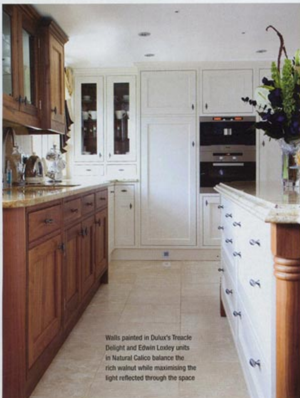
Walls painted in Dulux's Treacle Delight and Edwin Loxley units in Natural Calico balance the rich walnut while maximising the light reflected through the space